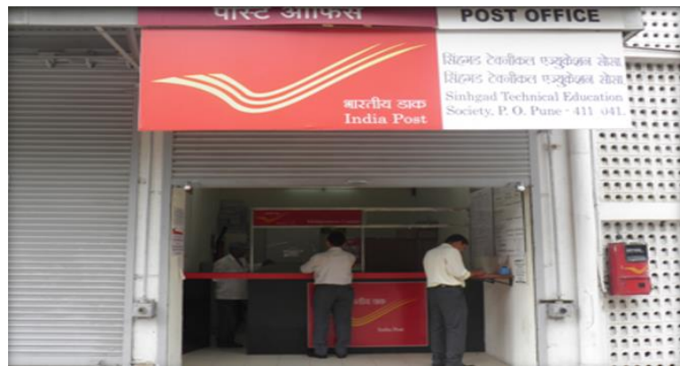
Post Office inside Campus