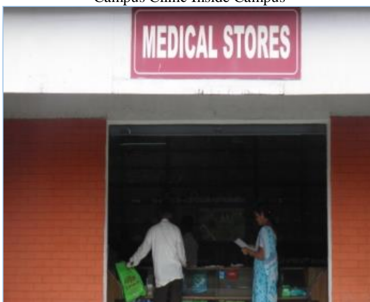
Medical Sho inside Campus