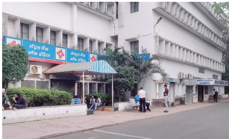
National Bank inside Campus