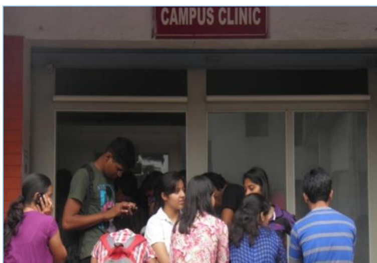
Campus Clinic Inside Campus