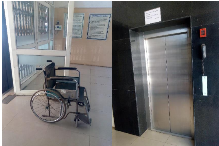
Wheelchair and Lift