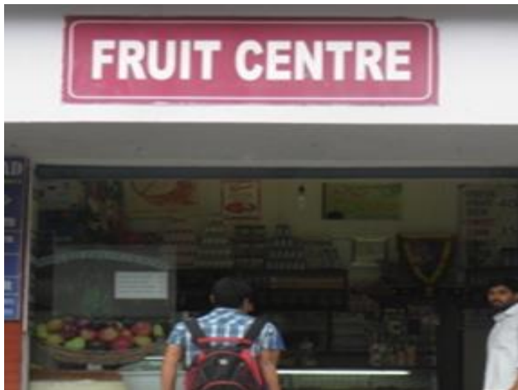
Fruit Centre inside Campus