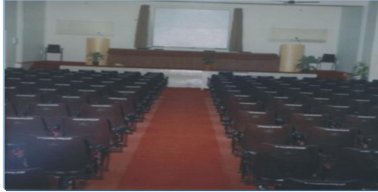
STES Central Auditorium