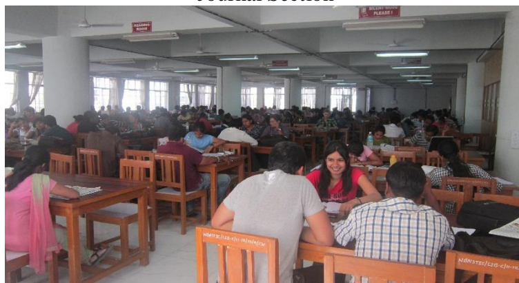
24X7 Reading Hall with