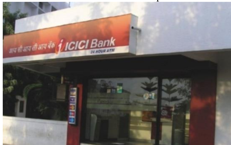
ATM Center inside Campus