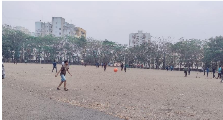
Open ground for outdoor activities