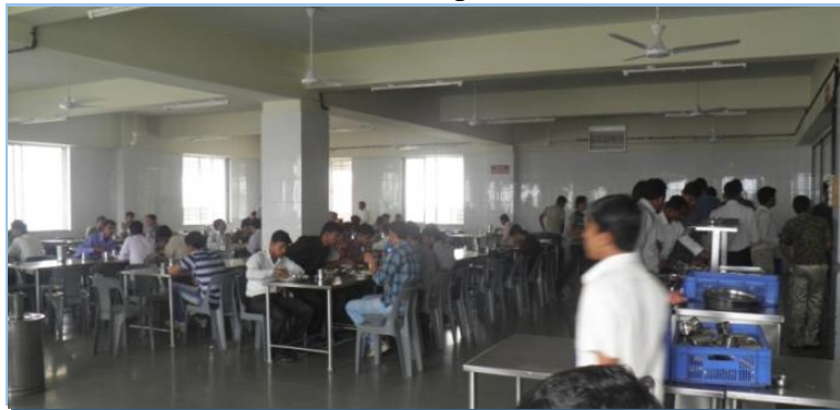
Hostel Mess Facility