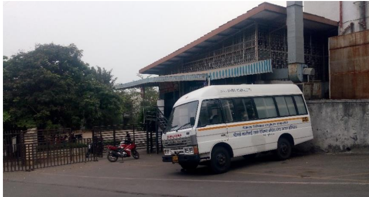
Ambulance at campus 20X7X365