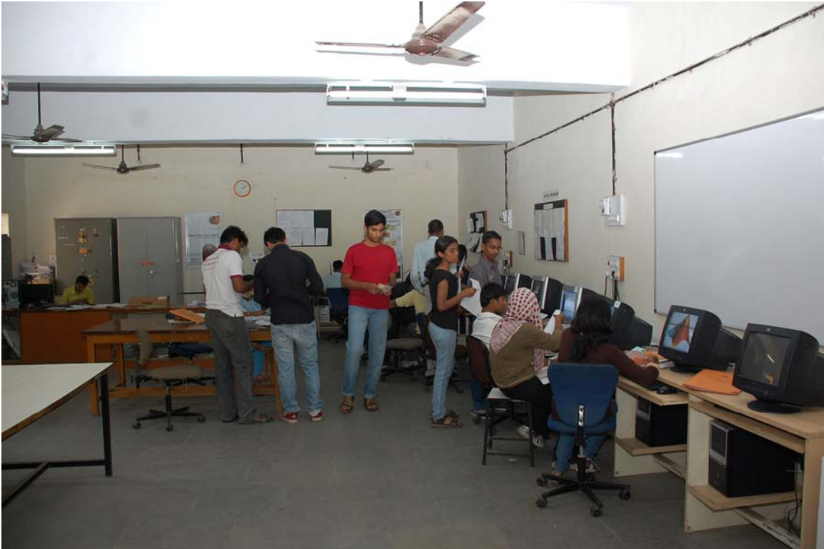
Applied Physics (Laboratory)