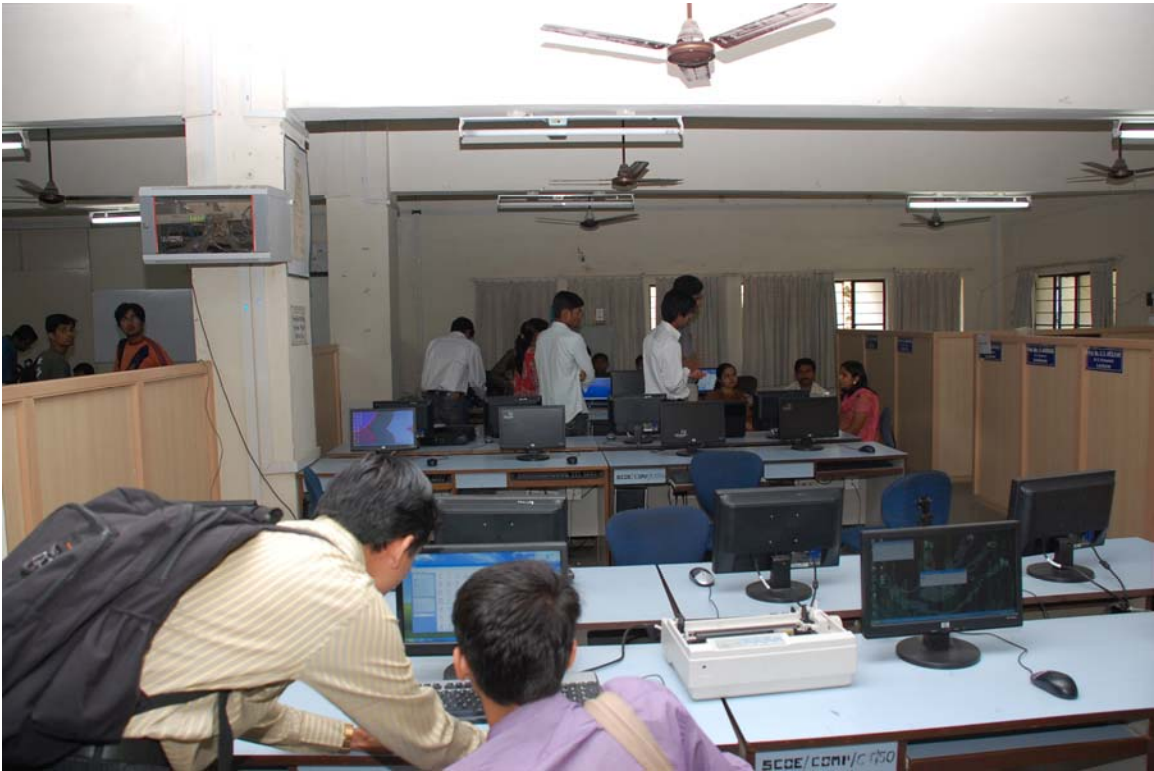
Electronics & Telecommunication (Laboratory)