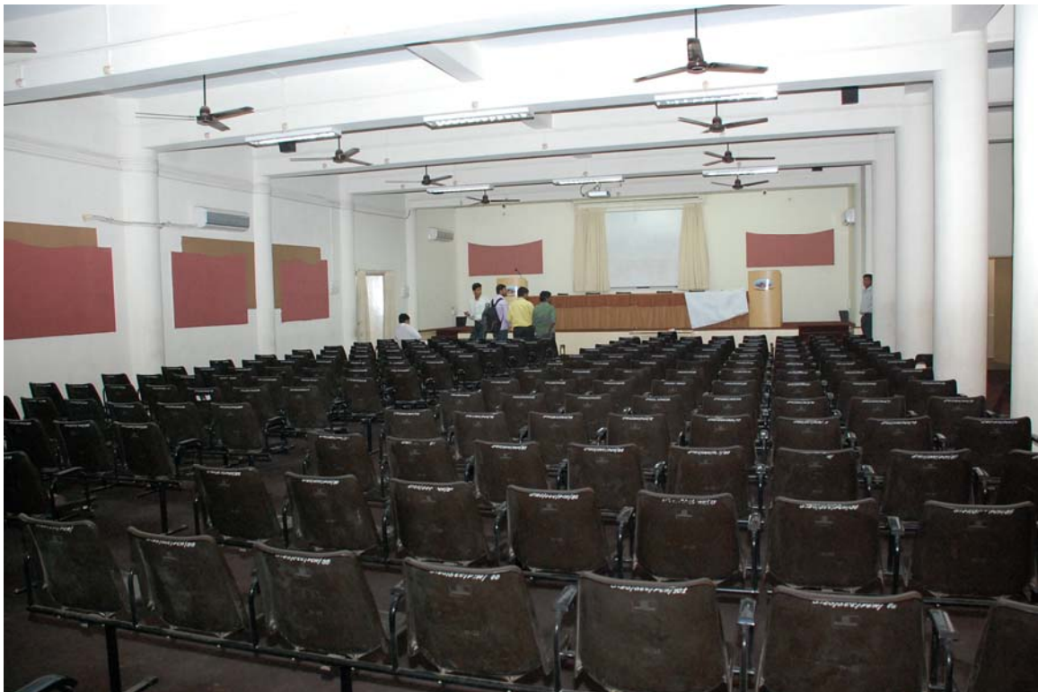
Indoor Sports facilities