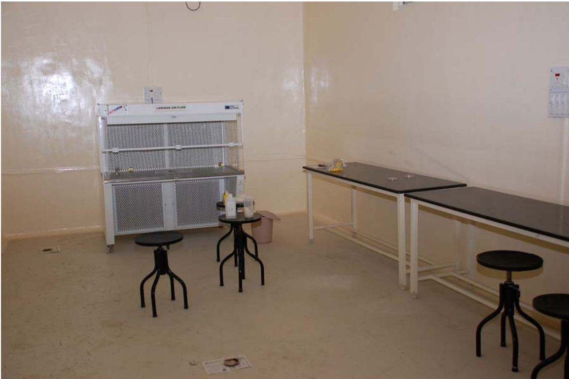
Mechanical Engineering (Laboretory)