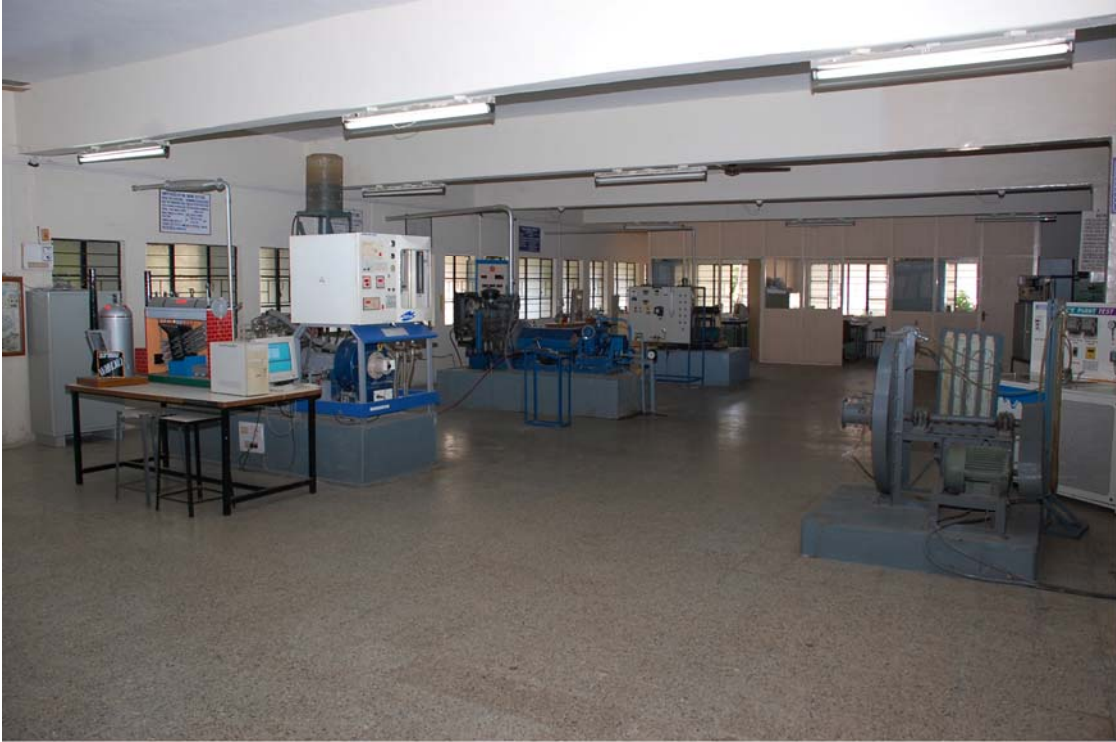
Production Engineering (Laboretory )