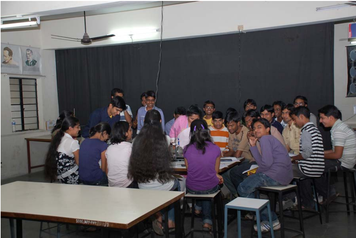
Electrical Laboratory (Laboretory)