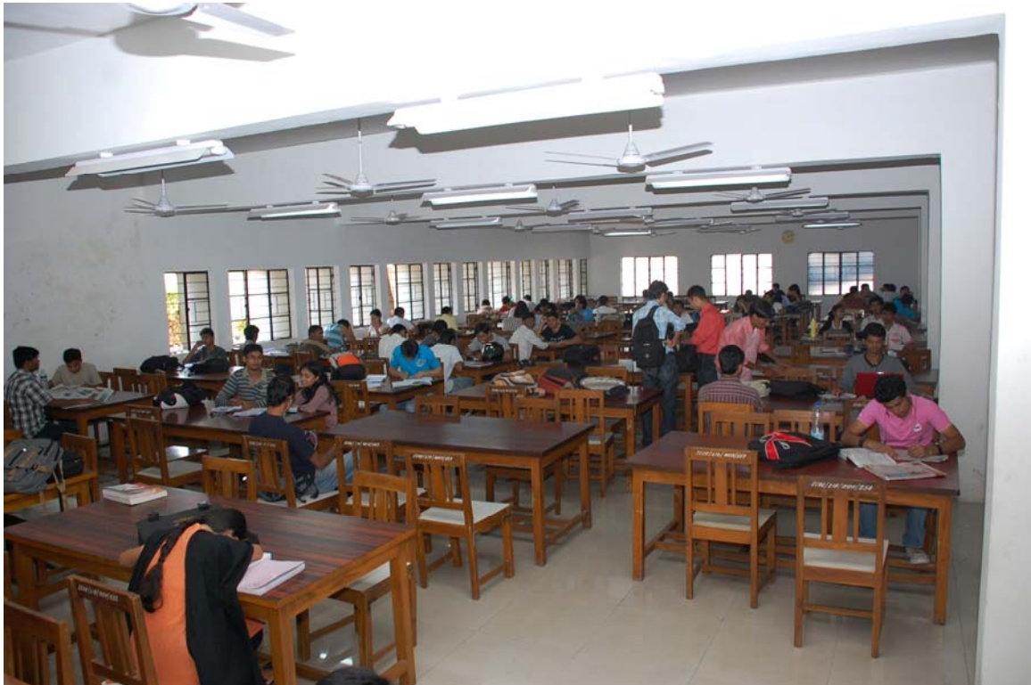
Library Stacking Area