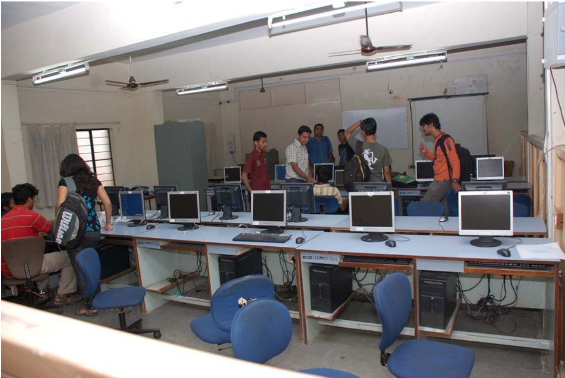
Computer Engineering (Laboratory)