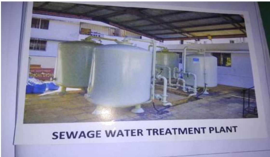
Sewage Water Treatment Plant